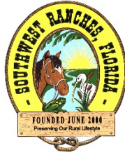
EXHIBIT "A" AGREEMENT BETWEEN THE TOWN OF SOUTHWEST RANCHES AND