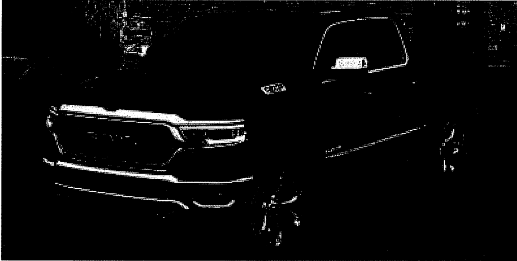
Note: Photo may not represent exact vehicle or selected equipment.

Vehicle: [Fleet] 2021 Ram 1500 (DT6L91) Tradesman 4x4 Crew Cab 6'4" Box (✔ Complete)